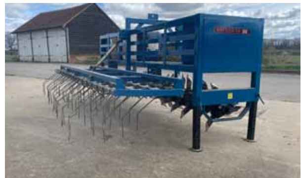
RAYSON AERATOR & TINES VIRTUALLY AS NEW HARDLY USED – LOT 132