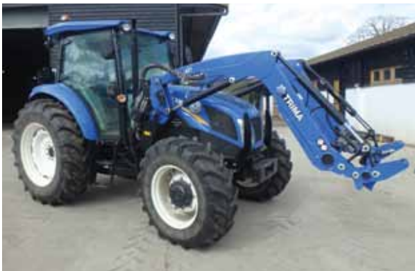
NEW HOLLAND TD5.105 ONLY 800 HOURS – LOT 143

Wine store/Chiller room – Steel timber concrete block building