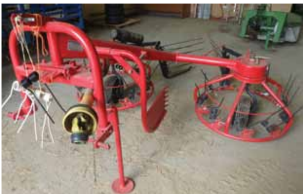
UNIVERSAL HAYBOB VIRTUALLY AS NEW HARDLY USED – LOT 135