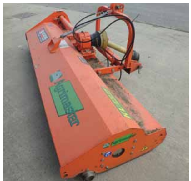
AGRIMASTER KL 270 SHREDDER LOT 136