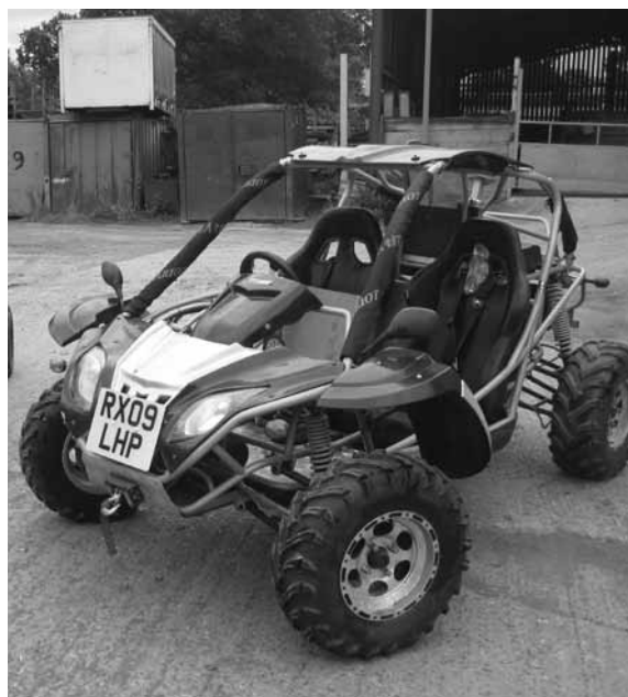
Quadzilla buggy – 550cc Petrol powered – Lot 1056